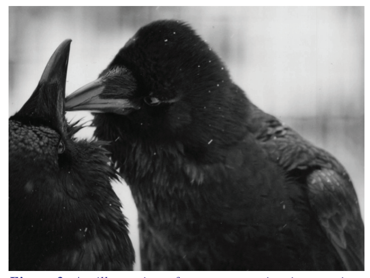
Figure 3. An illustration of ravens engaging in preening, which is an analogue to grooming in primates.

Specifically in these small groups, ravens engage in a range of socio-positive behaviors. They may share and offer food or, in a playful manner, show and offer non-food items (Pika and Bugnyar, 2011); they may sit in close contact (within reach of the other's beak) and engage in reciprocal allopreening (analogue to grooming in primates) with particular individuals over extended time periods (Figure 3). This fits with reports from captive colonies (Lorenz, 1935; Gwinner, 1964; Heinrich, 1999) and suggests that ravens form affiliate relationships or social bonds. Importantly, such social bonds are not restricted to reproduction (mated pairs) but can be found in all age classes (juveniles in their first year, subadult and adults), between and within sexes and, to some extent, also between siblings of the same clutch (Fraser and